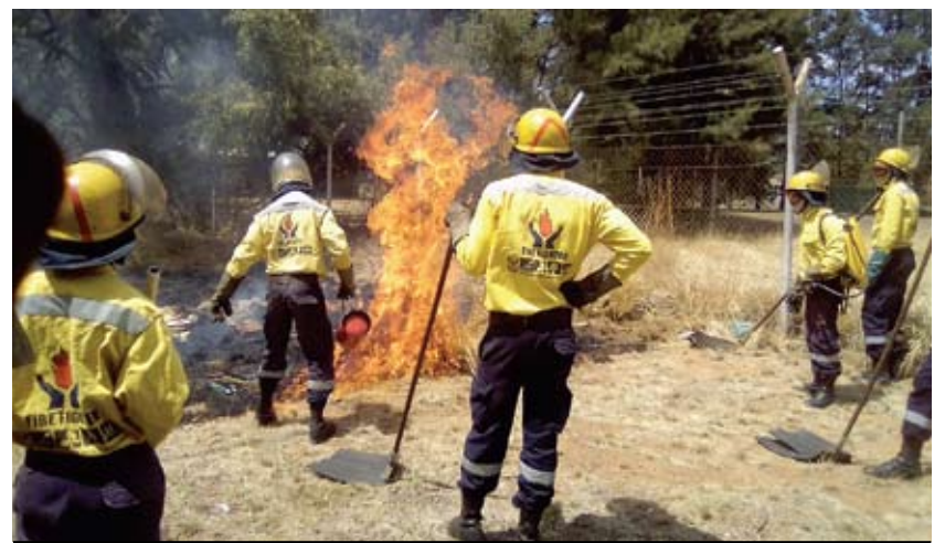
The Vaalharts Team conducted a block burn to reduce the fuel load while the Naledi Team taught learners about fire safety.

Both teams believe that the more people understand the impacts