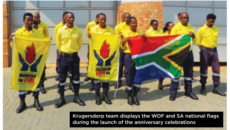
Krugersdorp team displays the WOF and SA national flags during the launch of the anniversary celebrations

Working on Fire Gauteng celebrated the 15th anniversary of the existence of the Working on Fire programme at the base of the Krugersdorp team, one of the first teams to be established in the province.