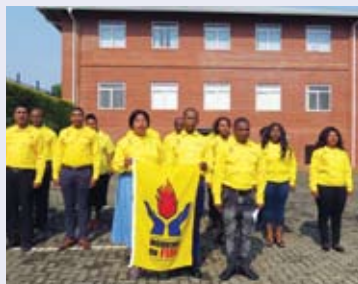
Provincial staff singing the national anthem

WOF KwaZulu-Natal officially launched its celebration of 15 years of Working on Fire service. Provincial management and firefighters at their bases sang the national anthem and read the WOF values with pride to kick-start the celebration with the external partners in the province.