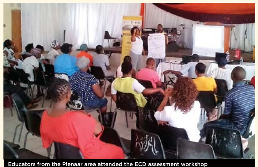
Educators from the Pienaar area attended the ECD assessment workshop

The main aim of this workshop was to assess ECD educators' knowledge retention of fire safety messages that they were taught during a workshop held in 2015 in the area. The facilitators wanted to determine what impact these