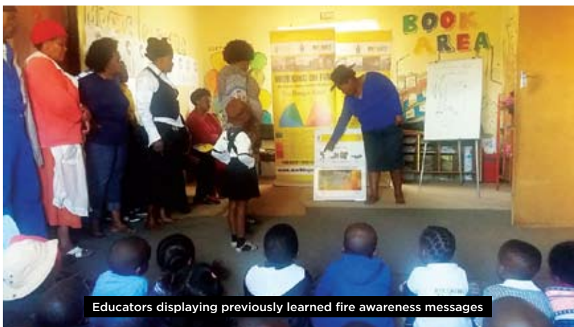
Educators displaying previously learned fire awareness messages

The Working on Fire Fire Awareness Department recently held assessments with 26 Early Childhood Development (ECD) educators from various ECD centres in the central Free State region.