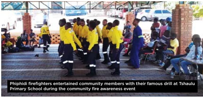
Phiphidi firefighters entertained community members with their famous drill at Tshaulu Primary School during the community fire awareness event

The Phiphidi participants in Limpopo took it upon themselves to equip and empower their communities with fire safety knowledge.