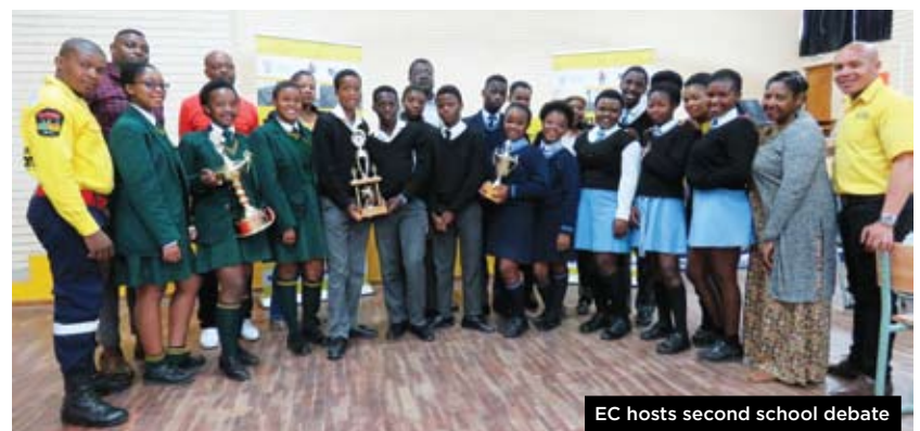
EC hosts second school debate

Working on Fire fights veld and forest fires through Integrated Fire Management Services (IFMS) that include fire detection, prevention and suppression and fire awareness in schools and in communities. The WOF programme works with schools in fire-prone areas to mitigate fire hazards