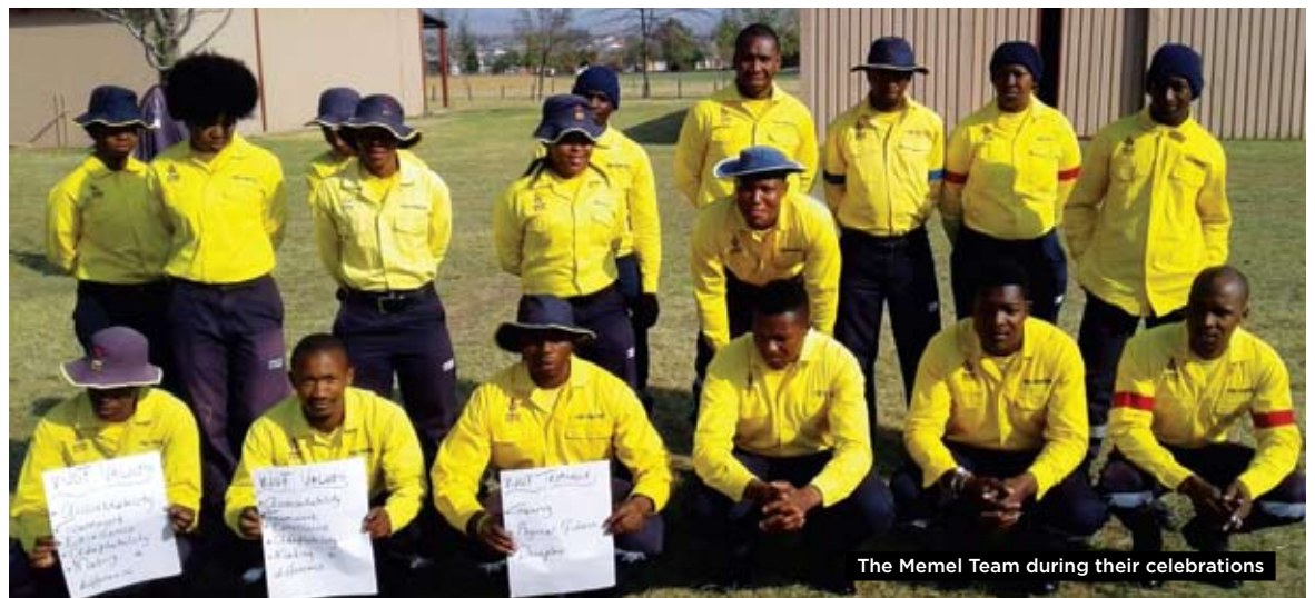
The Memel Team during their celebrations