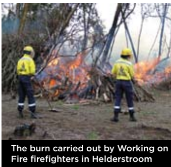
The burn carried out by Working on Fire firefighters in Helderstroom

Forty Working on Fire (WOF) firefighters in the Western Cape assisted the Department of Environmental Affairs (DEA) to manage a controlled burn along the Helderstroom Road, near the Helderstroom Maximum Prison. The team cleared close to 19 hectares of veld in preparation for the 2018/19 summer fire season.