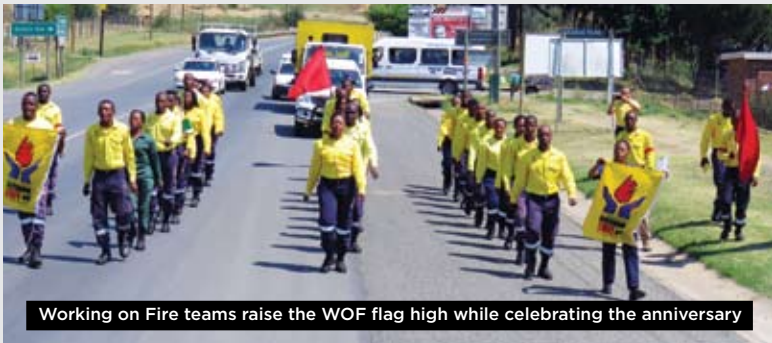
Working on Fire teams raise the WOF flag high while celebrating the anniversary

In celebrating 15 years of existence, the Working on Fire programme in the Eastern Cape hosted its provincial celebration event in Keiskammahoek on 5 October in partnership with stakeholders.