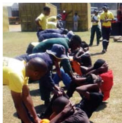
Youth in the Eastern Cape recently got work opportunities at WOF

They will now be taken to the training academy in Nelspruit where they will undergo training courses that include advanced firefighting, fire safety and other specialised skills. They will also be taught extensively about integrated fire management.