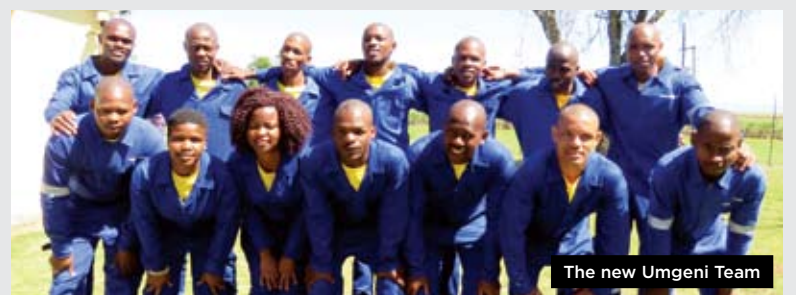
The new Umgeni Team

Working on Fire KwaZulu-Natal recently recruited 11 unemployed youth to create the new Umgeni High Altitude Team that will be based in Wartburg.