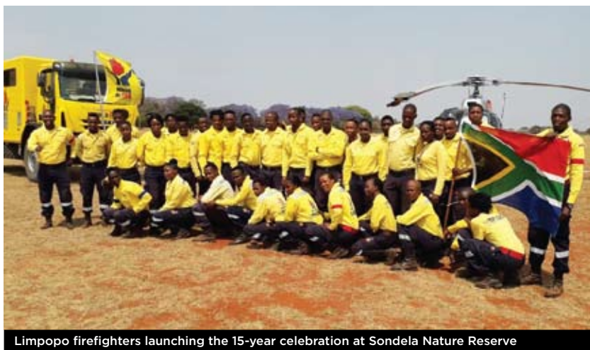
Limpopo firefighters launching the 15-year celebration at Sondela Nature Reserve