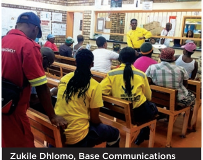
Representative of the Castello Team, addressing community members at mierbult Clinic

As the festive season is fast approaching, the WOF North West teams are doing everything they can to ensure communities are safe from disaster. The Castello Team and JB Marks Disaster Management held a festive season awareness activity at Rysmierbult Clinic