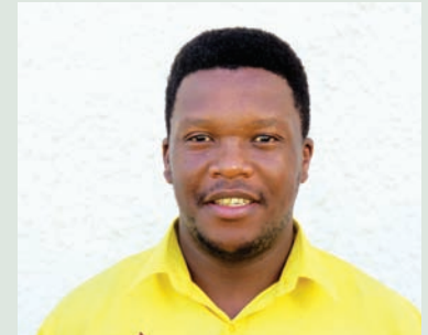
Working on Fire continues to open up opportunities for young people

Mlanjeni says working around the province with more than two teams