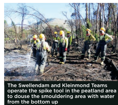
The Swellendam and Kleinmond Teams operate the spike tool in the peatland area to douse the smouldering area with water from the bottom up

The WOF team is working seven days a week and it is anticipated that it