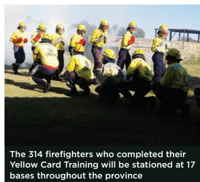
The 314 firefighters who completed their Yellow Card Training will be stationed at 17 bases throughout the province

On 25 May, the last group of firefighters from North West Working on Fire completed their Yellow Card Training Camp (YCTC). This brings the total number of firefighters who have completed the YCTC to 314. The firefighters will