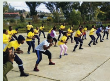
Bethlehem Alpha and Bravo Teams and regional management staff participate in an aerobics session

With winter having arrived it becomes important for us not to put away our running shoes but rather to become more active. Considering the annual weight gain most of us experience during this season due to indulging in warm comfort foods and staying under the blankets a bit too much, Move for Health Day on 10 May serves as a timely reminder to stay active.