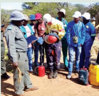
WOF participants educating the community about wildlife and fires

Working on Fire Limpopo's Marakele participants joined forces with UNISA environmental students to educate the community of Kagiso Village in Thabazimbi about wildlife and wildfires.