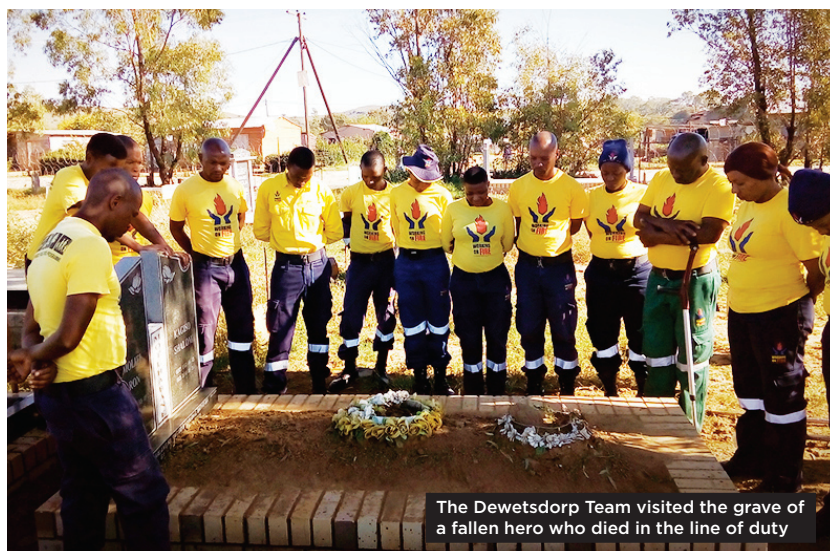
The Dewetsdorp Team visited the grave of a fallen hero who died in the line of duty

"Today we honour our heroes, our firefighters, and we want to thank them for their selflessness in the way they perform their duties and how they serve