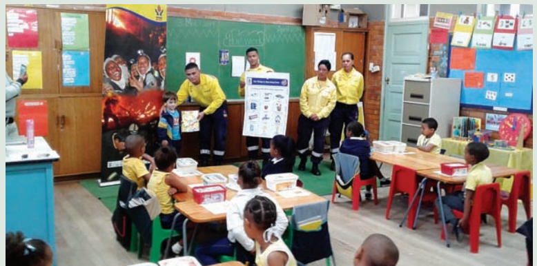
The Uniondale Team poses with the Grade R learners following a successful fire awareness programme.

Firefighters in the Western Cape are continuing to roll out the #BeFire-Safe message across the province in preparation for the 2019/20 summer fire season. Many of the 700 firefighters stationed in the Western Cape will be conducting fire awareness presentations that highlight the dangers of fire risks in communities, or will be giving demonstrations on how to construct firebreaks and reduce fuel loads to help eliminate the risk and spread of fire.