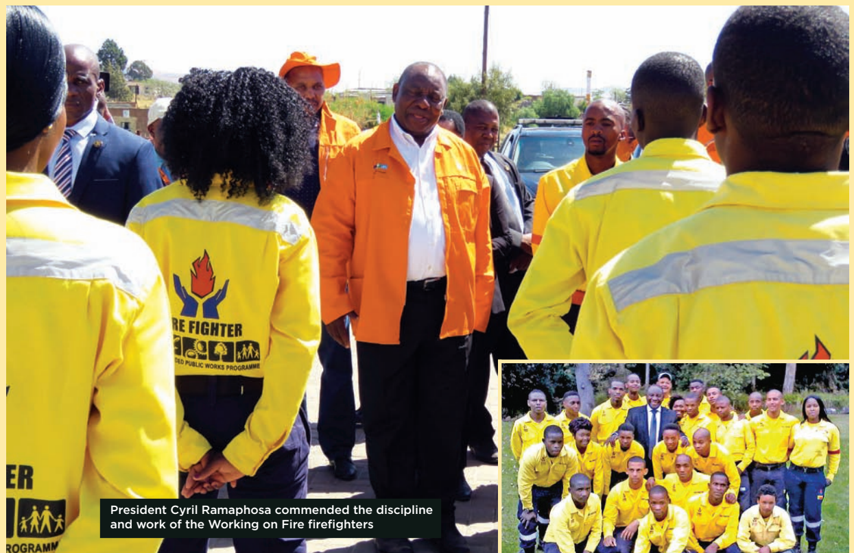
President Cyril Ramaphosa commended the discipline and work of the Working on Fire firefighters

President Cyril Ramaphosa has on several occasions spoken very highly of the success of Working on Fire and the work the programme does with young people. Working on Fire will continue to support President Ramaphosa's vision to advance South Africa by continuing its