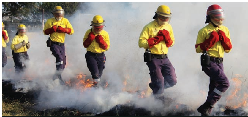
A total of 480 firefighters passed their Yellow Card Training and are ready for the fire season