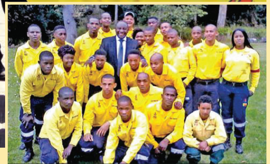
President Cyril Ramaphosa with Working on Fire firefighters during his visit to the Newlands Base