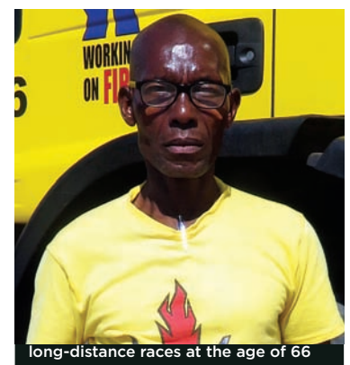
long-distance races at the age of 66

He proved his proud claim that he could outrun his colleagues at the recent Yellow Card Training Camp at the Kishugu Training Academy in Nelspruit when he went head to head with the younger males.