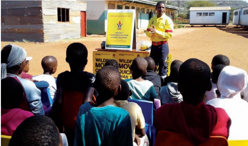
The Madikwe Team raised fire awareness at Motshabaesi Primary School.

With the onset of the winter fire season, WOF North West firefighters have been taking all possible steps to lower the risk of fire in the province. Teams have been working across the province doing fuel load reduction and implementing other fire prevention measures.