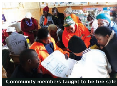
Community members taught to be fire safe