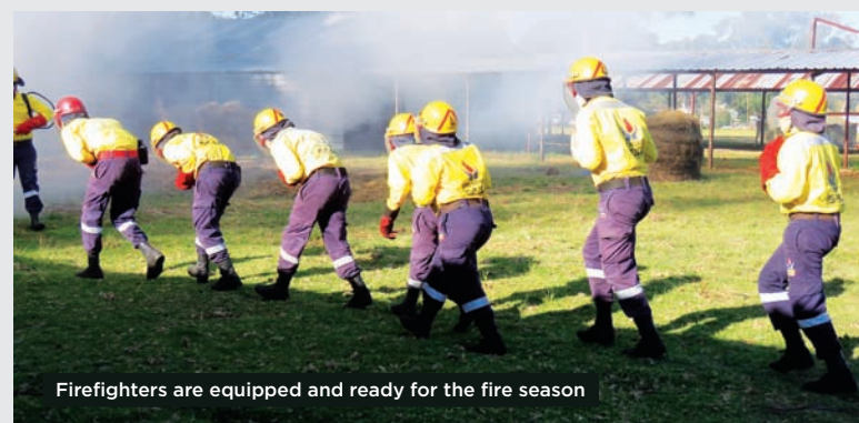
Firefighters are equipped and ready for the fire season

More than 300 firefighters from the 17 Working on Fire teams in the eastern part of the Eastern Cape passed their annual Yellow Card Training (YCT).