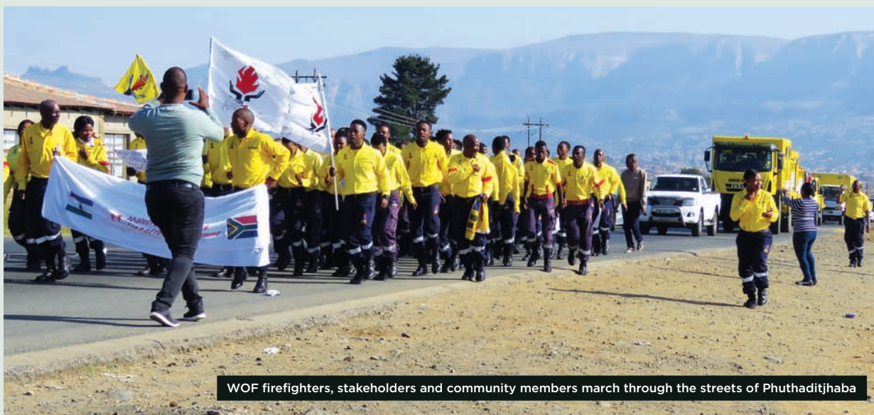
WOF firefighters, stakeholders and community members march through the streets of Phuthaditjhaba

Working on Fire hosted its fire season and Fire Awareness Campaign launch in QwaQwa on 22 May 2019. Stakeholders and community members participated in the event which started with a march through the main road