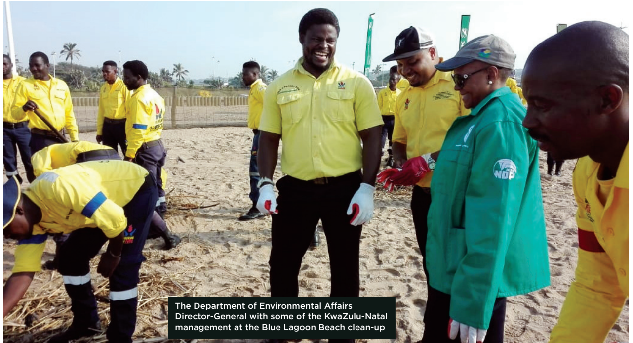
The Department of Environmental Affairs Director-General with some of the KwaZulu-Natal management at the Blue Lagoon Beach clean-up

Since the official launch of the Good Green Deeds Programme in March, Working on Fire, true to its call and passion to protect the environment, has shown its support by joining several clean-up campaigns across the country. WOF teams from KwaZulu-Natal, Eastern Cape, North West and Limpopo also joined several pre-launch activities in communities to promote and encourage communities to take responsibility for their surroundings and ensure that public spaces are clean and tidy.