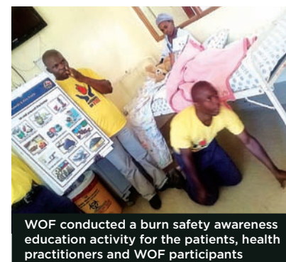
WOF conducted a burn safety awareness education activity for the patients, health practitioners and WOF participants

Building up to the FAC launch, the Fire Awareness Team conducted joint activities with stakeholders to encourage communities to get ready for the fire season. The Fire Awareness Team worked with JB Marks Disaster Management, the Traffic Department, Department of Health, local Fire Department, Labour Department and the South African Police Services to raise awareness about the different stakeholders' services and promoted fire safety at various schools and communities and through the local radio station.