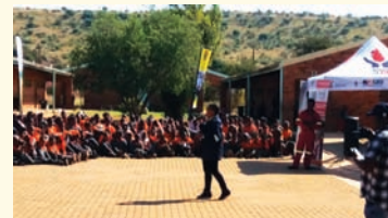
The North West Fire Awareness Team and firefighters have been conducting fire awareness activities building up to the Fire Awareness Campaign launch.

On 31 May, the North West Fire Awareness Team and various stakeholders launched the Fire Awareness Campaign (FAC) to prepare communities for the winter fire season. The FAC aims to teach communities how to be fire safe and how to prevent unwanted wildfires. The campaign raises awareness of the risk of wildfires and empowers those at risk to take responsibility to reduce the risk and impact of fires in their communities.