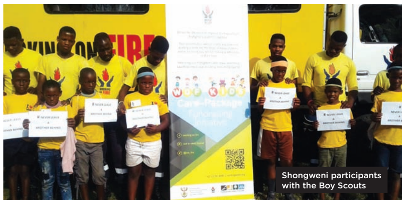
Shongweni participants with the Boy Scouts

After an explanation of the ground rules and expectations, a briefing session was conducted that defined what being 'a boy' meant and the roles boys must play at home and in the