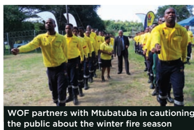
WOF partners with Mtubatuba in cautioning the public about the winter fire season

A roadshow was held on the following day, with Working on Fire and Mtubatuba Municipal firefighters drilling in town and using a loudhailer to address