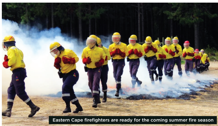
Eastern Cape firefighters are ready for the coming summer fire season

The yellow card assessment fitness test includes a 2.4 km run in a maximum