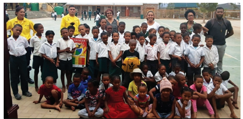
The Uniondale Team conducted a fire awareness activity for Grade 6 and 7 learners

As part of the preparation for the start of the summer fire season, Western Cape Working on Fire teams focused on raising fire awareness in communities and schools. This was done to ensure that community members took responsibility for their fire risks and knew what to do in the event of a fire to ensure their safety.