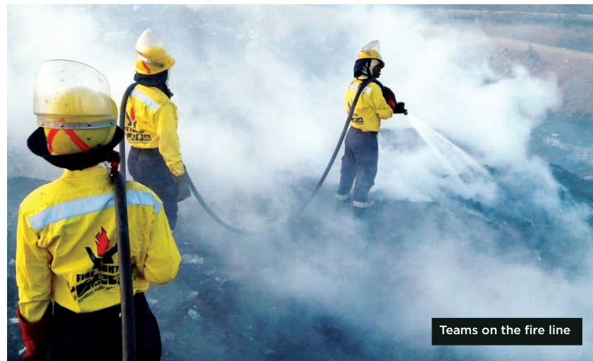
Teams on the fire line

The Msunduzi Landfill fire was successfully suppressed on Saturday, 12 October, with no fatalities.