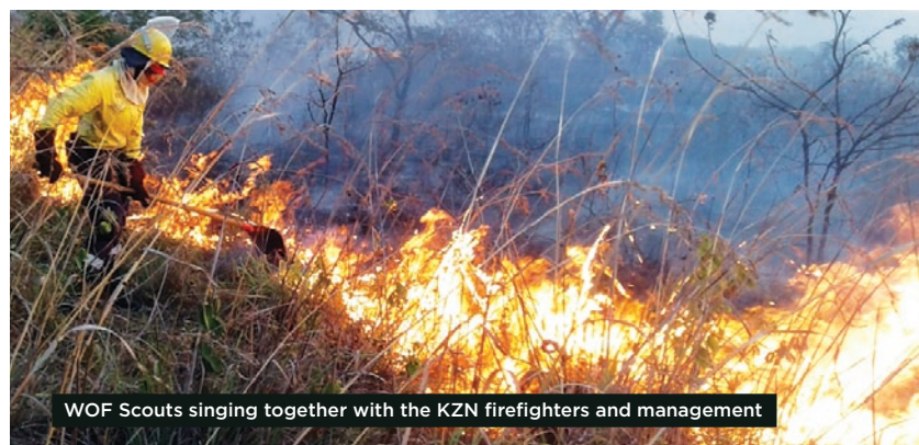
WOF Scouts singing together with the KZN firefighters and management

WOF teams across Mpumalanga have been hard at work assisting their Fire Protection Associations with various veld and forest fires. A total of 24 teams were dispatched to battle blazes in September, when WOF teams assisted in the suppression of 53 fires, eight more than the 45 fires suppressed in August.