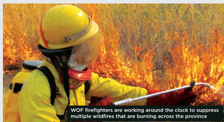
WOF firefighters are working around the clock to suppress multiple wildfires that are burning across the province

The Department of Environment, Forestry and Fisheries' Working on Fire firefighters in Limpopo have been kept on their toes by multiple wildfires that are burning across the province.