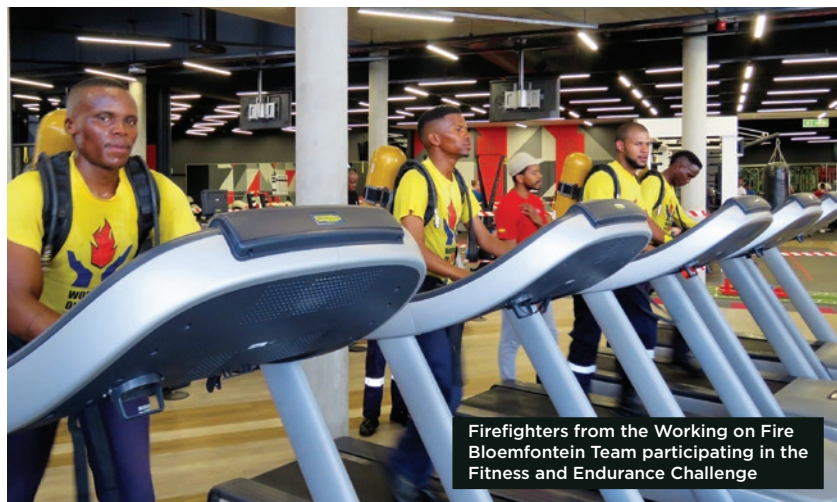
Firefighters from the Working on Fire Bloemfontein Team participating in the Fitness and Endurance Challenge