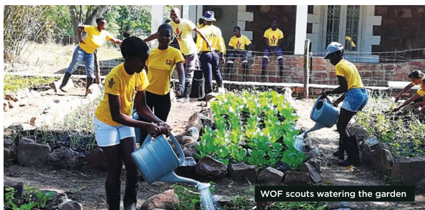
WOF scouts watering the garden