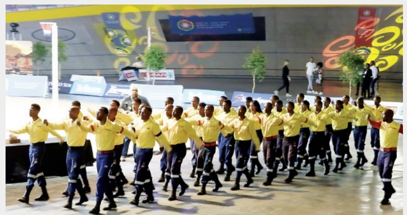
False Bay and Kleinmond Teams showed off their drilling skills at the opening ceremony

"We were impressed when we saw them practice their performance. They displayed professionalism and knew what they were doing. It was such a joy watching them and we hope to work with them again in the future."