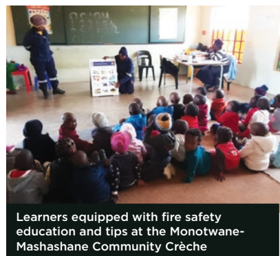
Learners equipped with fire safety education and tips at the Monotwane-Mashashane Community Crèche

"We believe that the kids should be groomed and shaped in the best method that they understand. Which is the reason why we opted to educate these