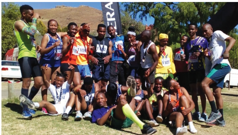
Working on Fire firefighters participated in the Clarens Golden Gate 4 in 1 event

Athletes from the Working on Fire Free State Athletics Club recently competed in the prestigious Clarens Golden Gate 4 in 1 races that took place in Glen Reenen in the Golden Gate National Park.