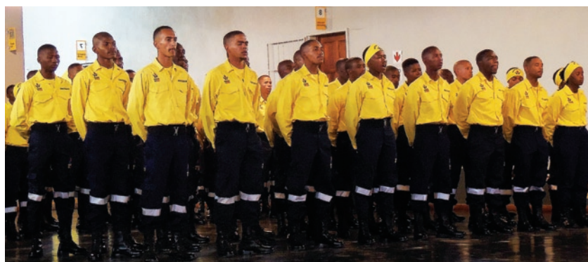
New recruits stand proudly during their graduation ceremony at Kishugu Training Academy