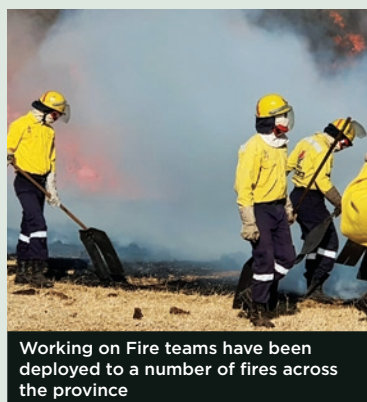
Working on Fire teams have been deployed to a number of fires across the province

The province's partnerships with FPAs and landowners, along