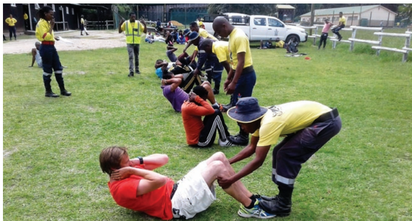
More that 100 young people tried out for the recruiting opportunity at Working on Fire in the Eastern Cape