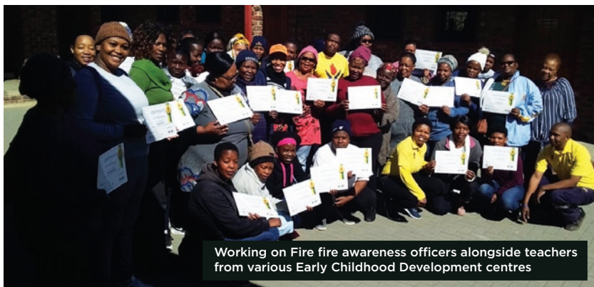
Working on Fire fire awareness officers alongside teachers from various Early Childhood Development centres

The Free State Fire Awareness Officers held a FireSafe workshop to teach Early Childhood Development (ECD) teachers in the Heilbron area about the fundamentals of fire, how fires are started, how to extinguish different types of fires, the different sources that can fuel a fire as well as how to successfully evacuate during a fire. The teachers were also empowered with knowledge to return to their schools to teach the children fire safety.