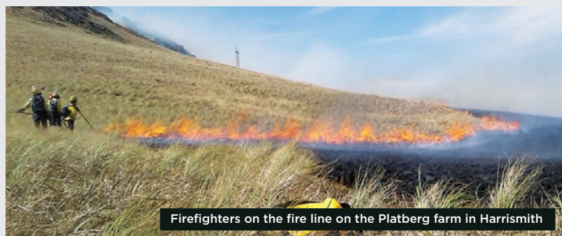
Firefighters on the fire line on the Platberg farm in Harrismith

The Free State saw recent evidence of this effect of climate change with the massive fire in the Harrismith area in the