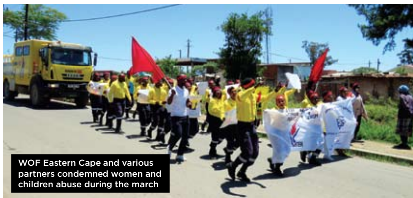
WOF Eastern Cape and various partners condemned women and children abuse during the march

After the march, there will be a gathering where stakeholders will share