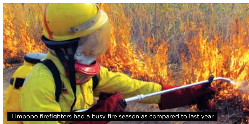
Limpopo firefighters had a busy fire season as compared to last year