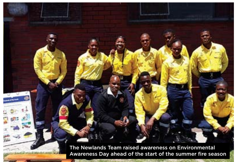
The Newlands Team raised awareness on Environmental Awareness Day ahead of the start of the summer fire season

As part of fostering increased safety awareness ahead of the Western Cape summer fire season, the Working on Fire Newlands Team, led by the Fire Awareness Department, attended the Masiphumelele Environmental Awareness Day event.