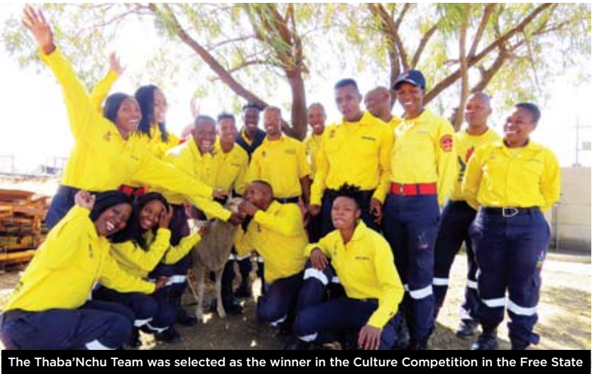
The Thaba'Nchu Team was selected as the winner in the Culture Competition in the Free State