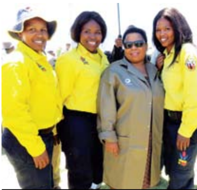
Deputy Minister Sotyu was impressed with the high visibility of female firefighters

Deputy Minister of Environment, Forestry and Fisheries, Maggie Sotyu, together with the Working on Fire Jonkershoek and Limietberg Teams, planted trees during the launch of the newly revamped Freedom Park in Worcester.