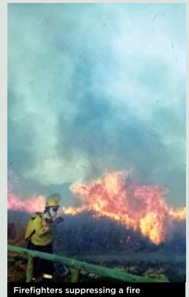
Firefighters suppressing a fire

WOF implements integrated fire management to ensure a safe fire season. This includes fire awareness activities which the programme implements at schools and communities and with other organisations and expanded public work programmes. Since April, firefighters have conducted 119 school fire awareness activities, 90 community door-to-door campaigns, 44 presentations and 10 FireSafe workshops to ensure communities were aware of the dangers of unwanted fires.