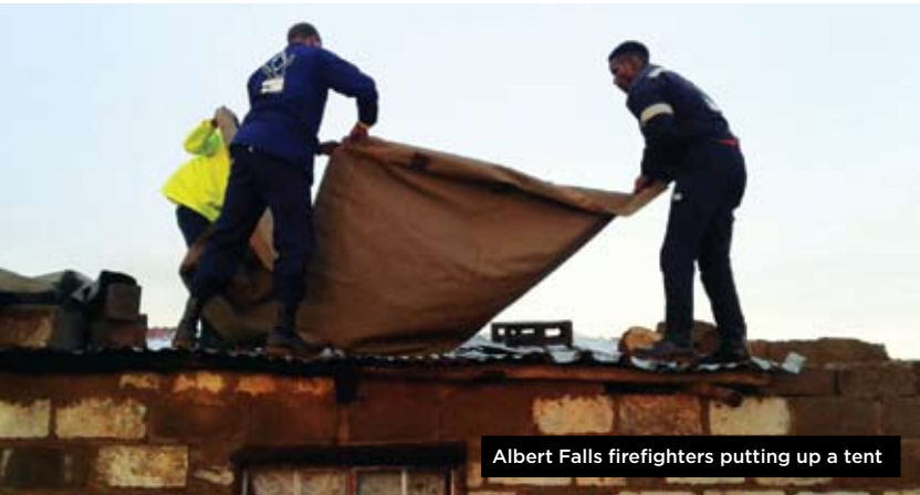
Albert Falls firefighters putting up a tent