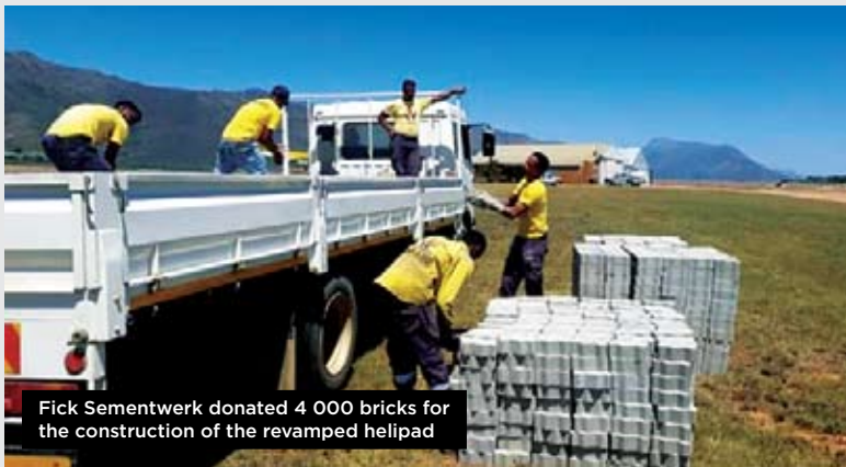
Fick Sementwerk donated 4 000 bricks for the construction of the revamped helipad

In preparation for the Western Cape summer fire season, a good Samaritan from Fick Sementwerk in Piketberg donated 4 000 bricks for the construction of a helipad for the aerial support stationed at the Porterville airbase.