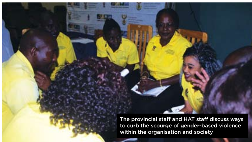
The provincial staff and HAT staff discuss ways to curb the scourge of gender-based violence within the organisation and society