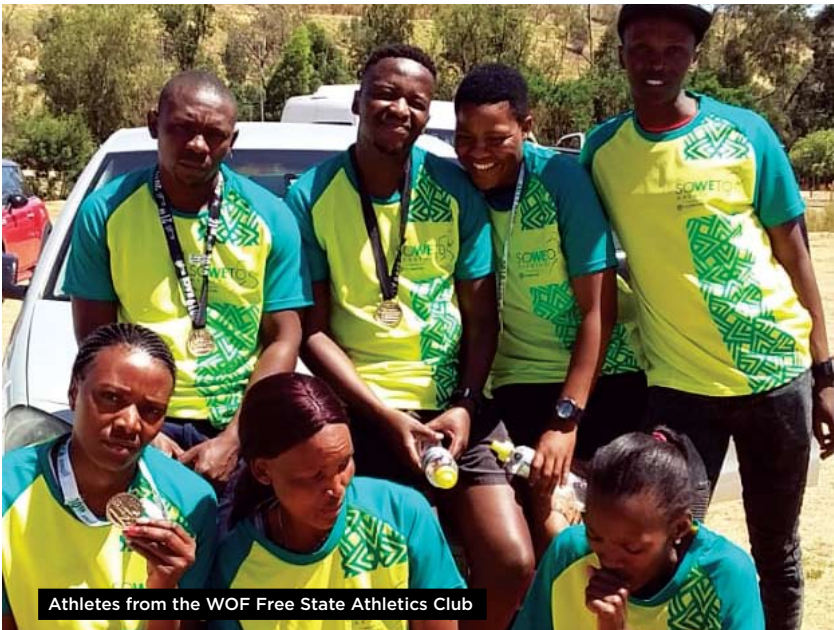
Athletes from the WOF Free State Athletics Club