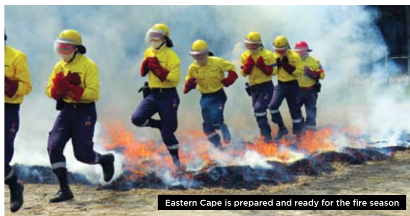
Eastern Cape is prepared and ready for the fire season

The Department of Environment, Forestry and Fisheries' Working on Fire programme has about 580 firefighters based at 26 bases in the Eastern Cape, as well as seven fire trucks, two strike units, nine buses, nine bakkies and two Avansas.