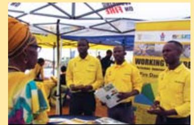
WOF participants engage with different stakeholders and community members at their exhibition stand during the Khawuleza event

During the event, WOF had an exhibition stand at the stadium where staff engaged with residents of various communities about the services that WOF renders and the impact that it