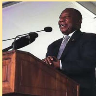
Cyril Ramaphosa during the Khawuleza launch.

"This development approach ensures that planning and spending across the three spheres of government are integrated and aligned and that each district or metro plan is developed with the interests and input of communities taken into account upfront," said President