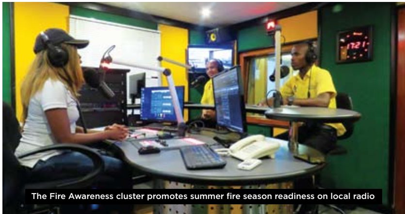
The Fire Awareness cluster promotes summer fire season readiness on local radio

The Department of Environment, Forestry and Fisheries' Working on Fire programme in the Eastern Cape hosts an annual fire awareness campaign launch at the Witelsbos Plantation Office on 28 November 2019.