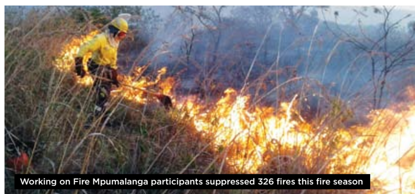
Working on Fire Mpumalanga participants suppressed 326 fires this fire season

The Department of Environment, Forestry and Fisheries' Working on Fire programme in Mpumalanga officially wrapped up the winter fire season on 31 October.