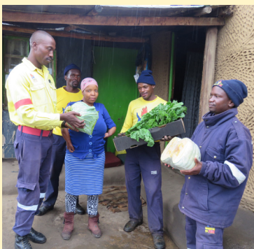
Clarens team members supplying community members with fresh vegetables.

The Working on Fire Clarens team identified a way that they can assist the impoverished community members of the small town of Clarens in which many of them reside in with fresh vegetables, grown in a garden on their base. This initiative was started by the Working on Fire Clarens