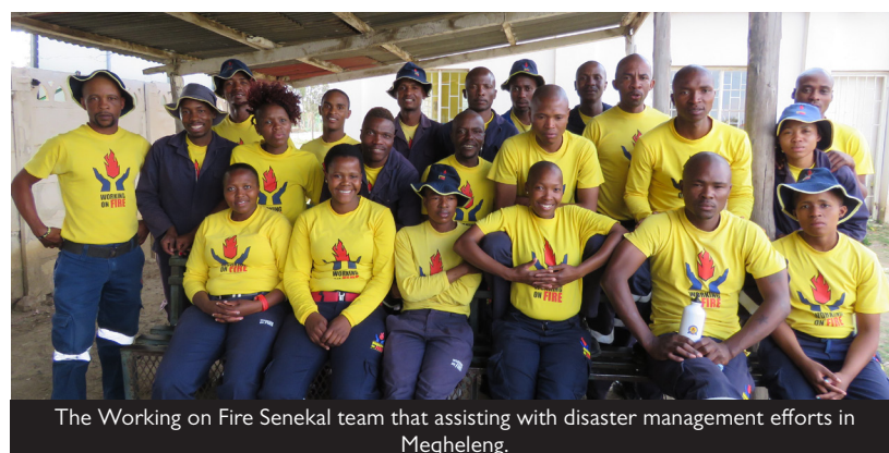
The Working on Fire Senekal team that assisting with disaster management efforts in Meqheleng.