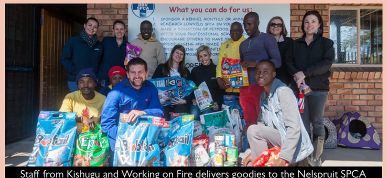
Staff from Kishugu and Working on Fire delivers goodies to the Nelspruit SPCA

Staff from Kishugu and Working on Fire, based at the Nelspruit Airfield, joined forces to donate time and resources to a very worthy project.