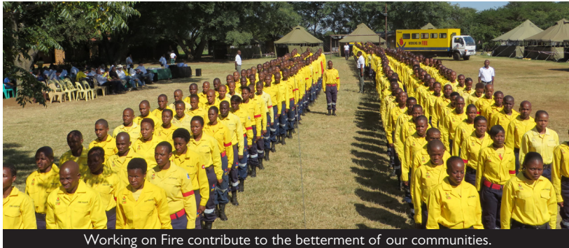
Working on Fire contribute to the betterment of our communities.

Working on Fire firefighters aspire to live by the Working on Fire values, especially the value of Making a Difference as it provides them with an opportunity to give back to their communities beyond firefighting. Working on Fire teams across the country make their contribution in communities on a daily basis by providing schools and old age cen-