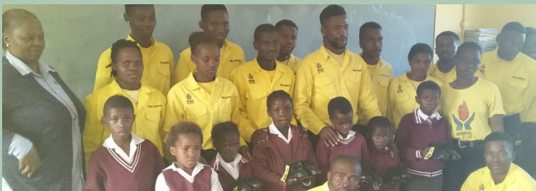
Cata team members distributed new school shoes to 10 learners.

The Department of Environment, Forestry and Fisheries' Working on Fire firefighters in Eastern Cape do not only show commitment in saving lives and the environment but continue to make a huge difference in their communities.