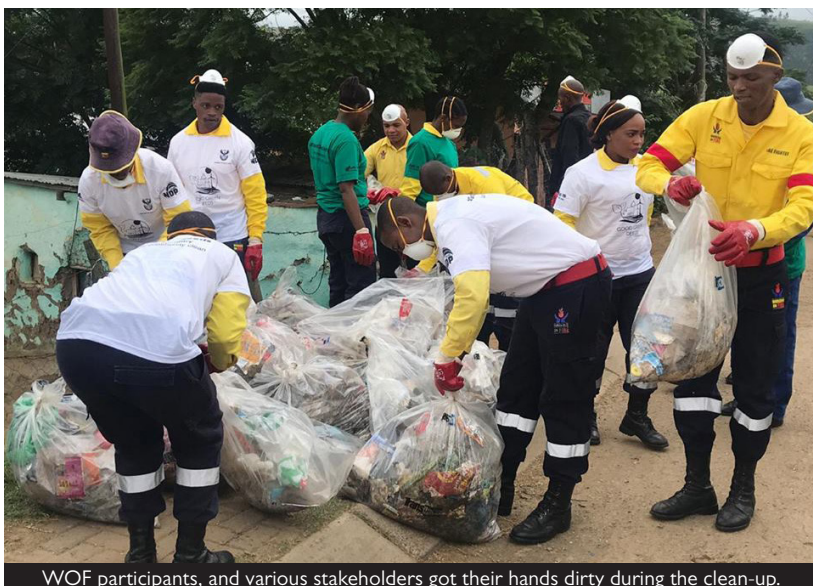
WOF participants, and various stakeholders got their hands dirty during the clean-up.

Working on Fire was on hand to support the Department of Environmental Affairs when President Cyril Ramaphosa launched the Good Green Deeds Programme in Mdantsane, Eastern Cape.