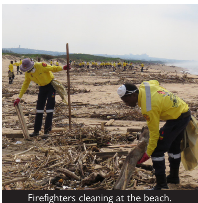
Firefighters cleaning at the beach.

Working on Fire in KwaZulu-Natal participated in the Good Green Deeds with the Shongweni, Karkloof and Albert Falls Teams and some provincial staff.