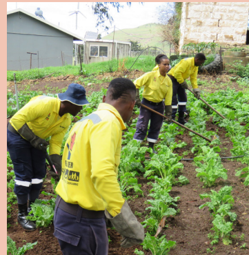
Elliot team members use their vegetable garden to benefit the community.

The Working on Fire Elliot Team continues to show commitment in giving back to the community and making a huge difference in people's lives.