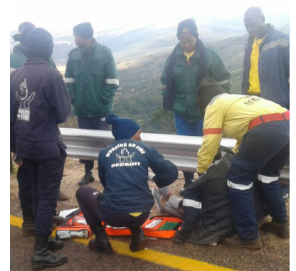
The team assisted by giving first aid to injured people.

It could well be fortuitous that these participants from the Working on Fire programme were on the scene of these incidents when help was needed the most. But most importantly through their quick and courageous actions, no lives were lost and they were able to treat those injured in these incidents with basic first aid until the medical emergency services arrived.