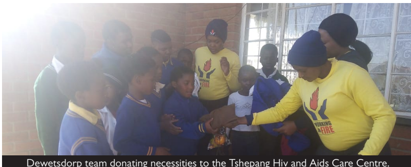
Dewetsdorp team donating necessities to the Tshepang HIV and Aids Care Centre.

The Working on Fire Dewetsdorp team along with staff members from the Free State provincial office observed a need for basic items to be donated to the Tshepang HIV and Aids Care Centre. The centre which serves the community by taking care of school learners and the adults impacted by HIV/Aids was the ideal place to partner with. Various necessities such as clothing items and small household appliances were donated to ensure that the centre runs smoothly. The Dewetsdorp team practices