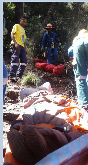
Working on Fire High Altitude Team participants carried the injured tourist on a stretcher for 2 km to get to an ambulance.

Working on Fire High Altitude Teams (HAT) are back at work after the excitement of rescuing a tourist from a very difficult situation.