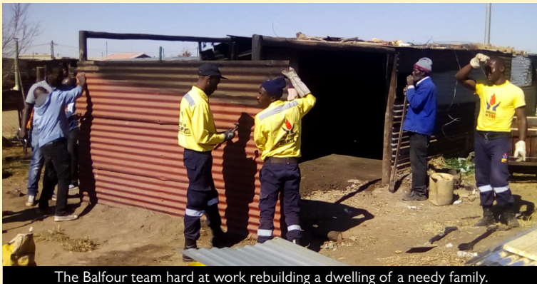
The Balfour team hard at work rebuilding a dwelling of a needy family.

Besides fighting fires on the fireline, the Balfour team in Mpumalanga continues to live by Working on Fire values of restoring dignity as they constantly give back to communities around their region.