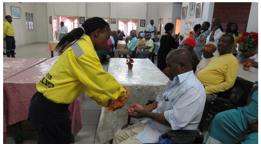
eThekweni Team spending time with the elders at an Old Age Home they had adopted.

In remaining committed to restoring dignity, the KwaZulu-Natal eThekweni Project Team visited the Zibambeleni Old Age Home, which they had adopted years ago. The team wanted to show their appreciation to the senior citizens living in the establishment.