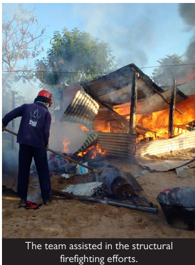
The team assisted in the structural firefighting efforts.

Participants in Working on Fire, the Department of Environment Forestry and Fisheries programme that help fight veld and forest fires, were praised this week for having come to the aid of two children who were trapped inside a burning shack in Modimolle (Waterberg District) in Limpopo.