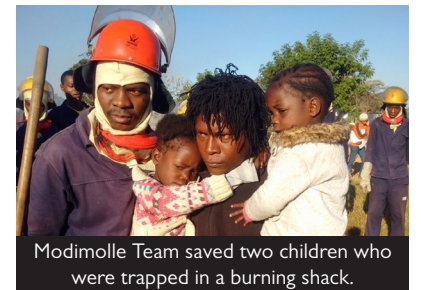
Modimolle Team saved two children who were trapped in a burning shack.

Both the children and the man were further checked by Emergency Medical Services Personnel who arrives on the side later.