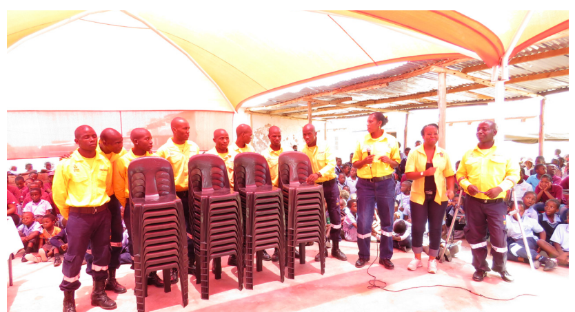
WOF donating 40 chairs for Rethusheng during the Disability Awareness event.

From time to time WOF participants visits the school to assist in cleaning and cooking for the learners and also to spend time with them.