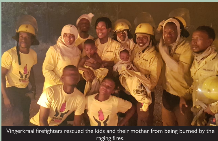
Vingerkraal firefighters rescued the kids and their mother from being burned by the raging fires.

The Department of Environment Forestry and Fisheries Working on Fire (WOF) Limpopo firefighters continues to work very hard battling multiple fire breakouts in the province outside the fire season.