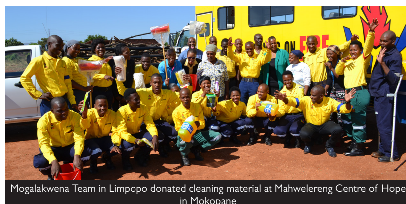
Mogalakwena Team in Limpopo donated cleaning material at Mahwelereng Centre of Hope in Mokopane