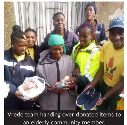
Vrede team handing over donated items to an elderly community member.